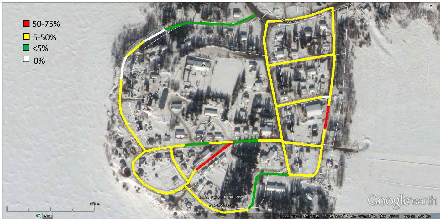
Figure 1. Map of Teslin Indicating of Distribution of Taraxacum officinale