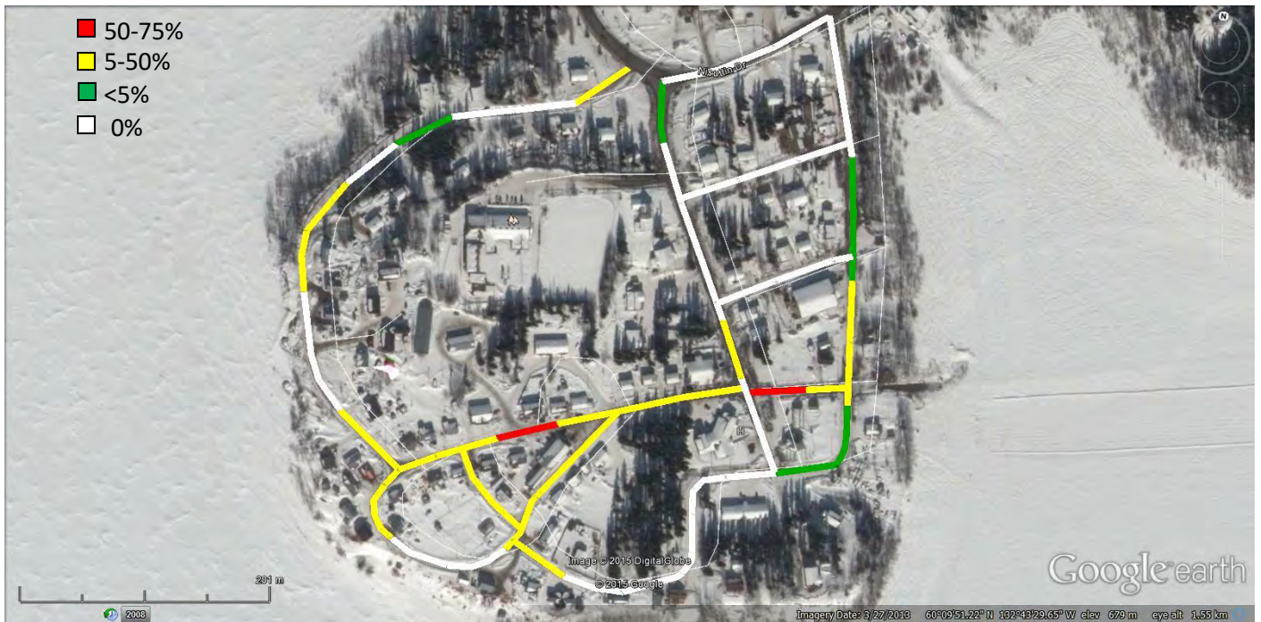
Figure 4. Map of Teslin Indicating of Distribution of Melilotus albus