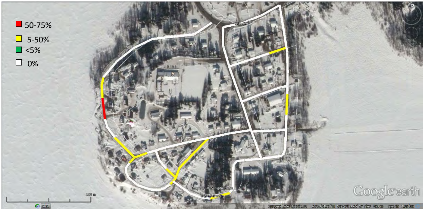
Figure 5. Map of Teslin Indicating of Distribution of Bromus inermis