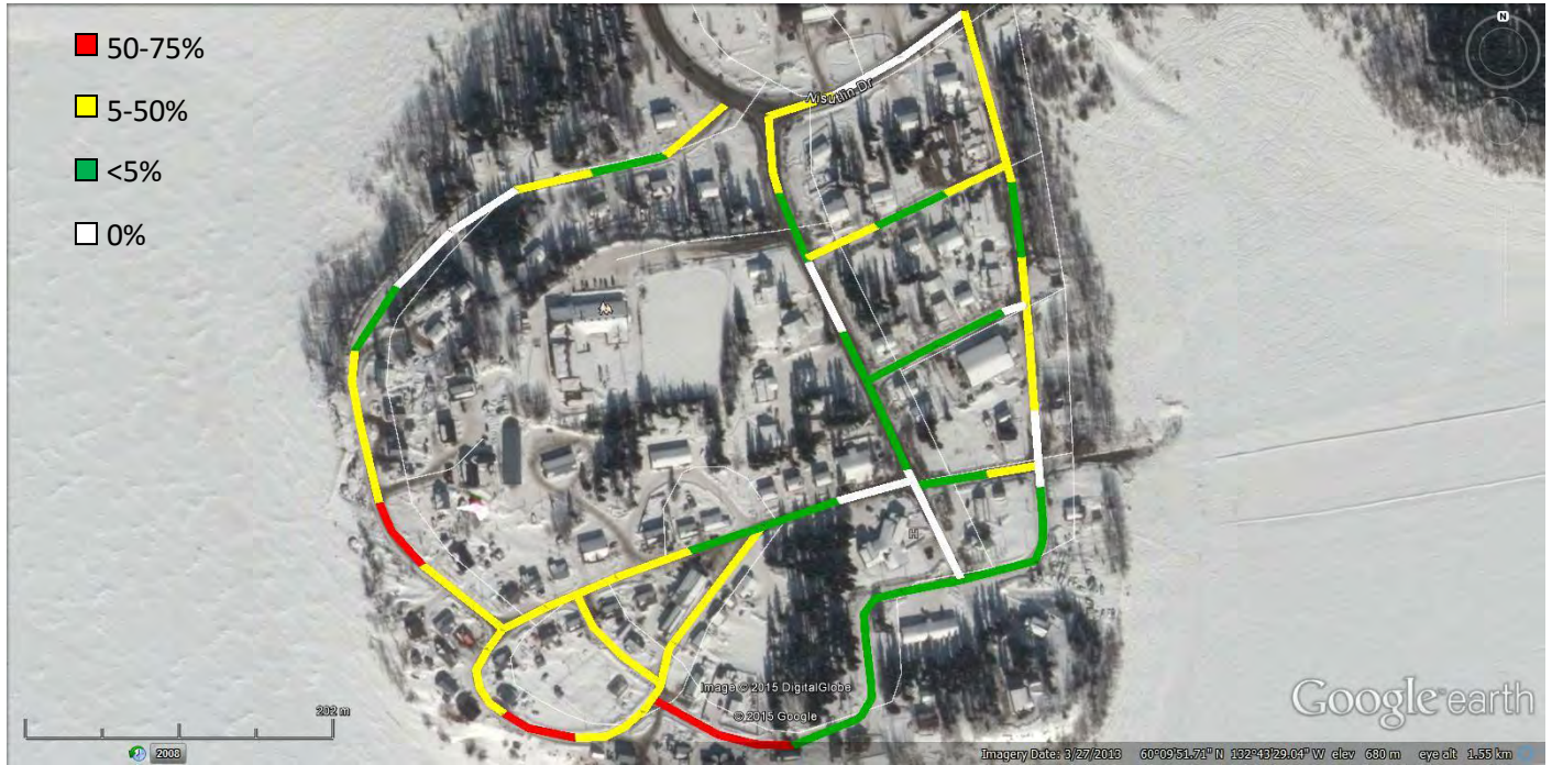
Figure 2. Map of Teslin Indicating of Distribution of Crepis tectorum