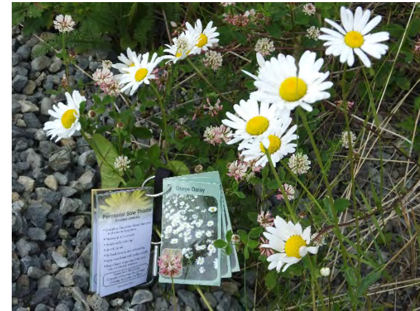
Educational tools (A. Strutkowski)