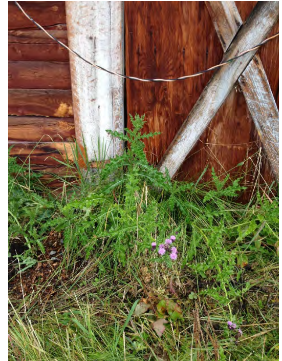
Creeping Thistle along an abandoned barn