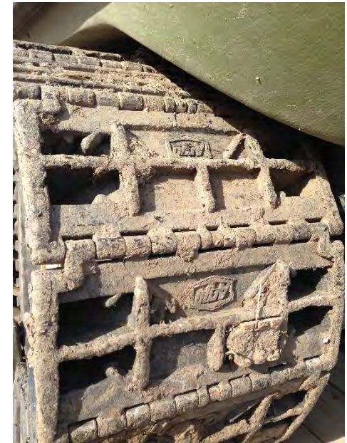
Effects of disturbance in the alpine