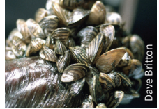
Zebra & Quagga Mussels